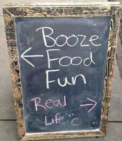
Seen outside a Pub.