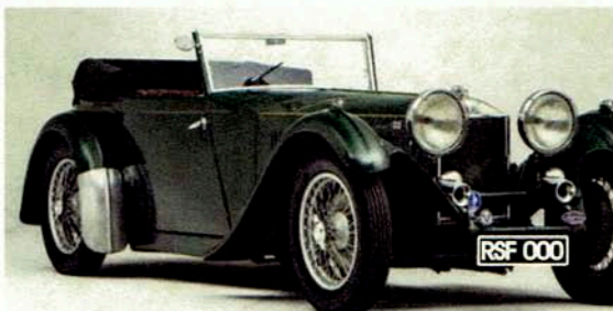
1930 Invicta S Type

Supporting the future of heritage motoring