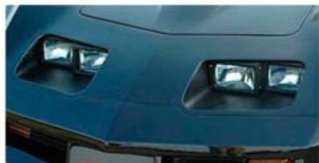
How they look installed.

MAG WHEELS 1 set of polished (both sides) 1989/91 mag wheels complete with ali spacer kit to suit 84/91 Corvettes. Al condition $1300 Phone Darryl 0410437136