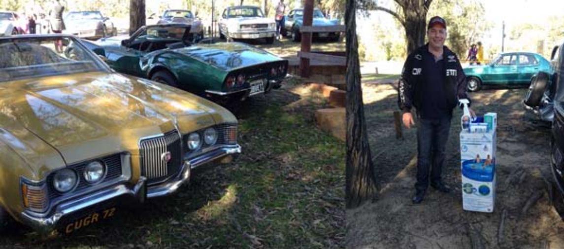
Pictures from the American Car Club's Independence Day run held on Sunday July 8th.